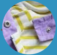
Easy Access Snaps