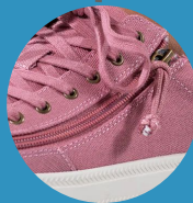
Side Zippers on Shoes

This publication was supported in part by grant number 2201SDSCDD-02 from the South Dakota Council on Developmental Disabilities.